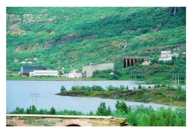
The mining complex and processing plant at Sulitjelma, Norway.

The rocks of the Sulitielma region are part of the Köli Nappe Complex in the Upper Allochthon of the Cen-Scandinavian tral Caledonides (Stephens et al., 1985: Cook et al., 1993; Boyle et al., 1994). These were folded and metamorphosed during the closure of the Japetus Ocean and the collision between Baltica and Laurentia