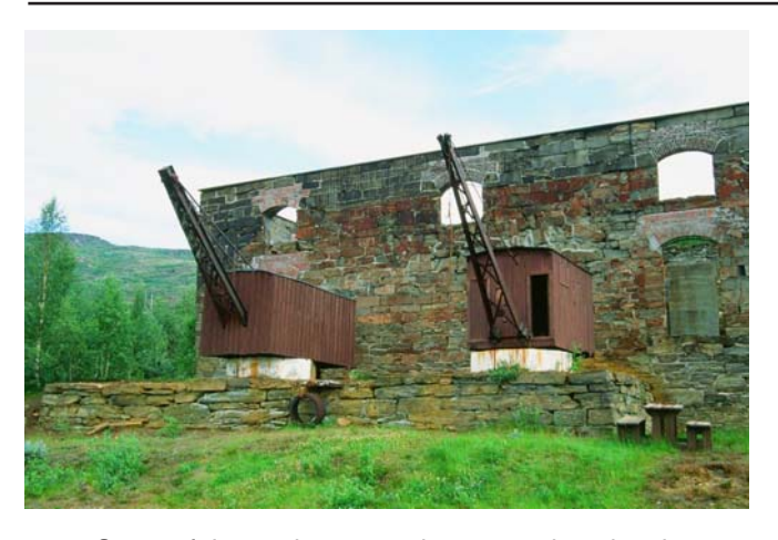
Some of the equipment at the processing plant in Sulitjelma, Norway.

The ore deposits at Sulitielma are stratabound volcanogenic massive sulphides (VMS) that formed at the top of the ophiolite from a hvdrothermal svstem on the seafloor (Cook. 1996: Frost et al., 2002). At least 20 deposits are recognised in the district (Cook et al.. 1990). They are