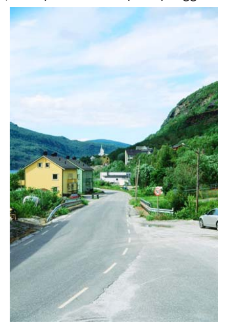
Sulitjelma, Norway in 2013.

The area around Sulitjelma was originally reindeer grazing land of the Sami people. The first permanent settlement appeared in 1848 and in the subsequent years a few farms were established. Ore