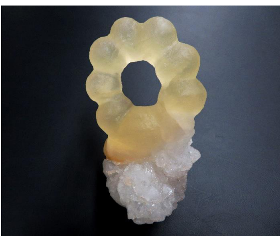
Fluorite balls, Deccan Plateau, Pune, India.

Each year, the Department's staff shares with the public news of its research and acquisitions through scholarly publications, provides displays at national and international mineral shows, and gives presentations to mineral clubs. Their search for new acquisitions is guided by the goals of developing a more complete collection, obtaining specimens representative of specific geological locations, and making minerals available for research purposes.