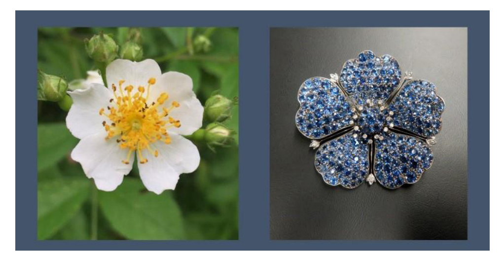
Wild Rose Flower and Yogo Sapphire Brooch

One of the attendees of Jeff's Zoom presentation asked about the striking similarity between the five-petal format of the brooch and the flower known as the Wild Rose. Jeff confirmed that the questioner was correct, noting that the flower was, indeed, the inspiration for the design of the brooch. After the meeting, Jeff provided these side-by-side images, leaving no doubt about the designer's intention.