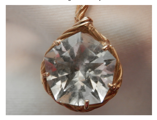
A modified Itone star cut in white topaz with a lasso mounting

successful. After serving in a variety of HGMS club office positions, I was elected to