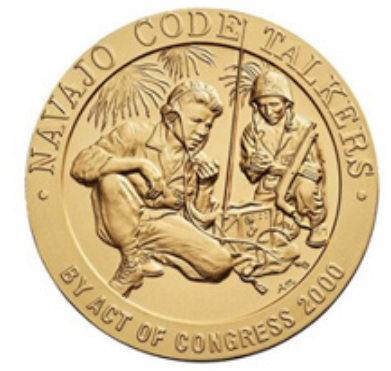
Congressional Medal: Navajo Code Talkers

For the time being, Archaeology will remain in the roster of sections, but dormant; if anyone is interested in working with the section, please let HGMS know and we will consider keeping it open.