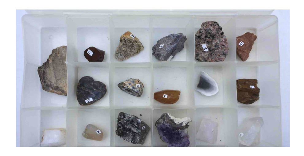
The Quartz Set, containing different examples of crystalline and massive quartz and rocks that are mostly quartz.

So where is School Collections going in the future? With the pandemic and the closing of the clubhouse in 2020 and 2021 not much has been happening, but that will change as life begins to return to normal by 2022. The number of sets on the shelves has declined to the point where new ones need to be created. These are done 50 at a time to maximize the benefits of scale. Throughout 2021 I will be putting out requests for volunteers to fold boxes and glue numbers on specimens.